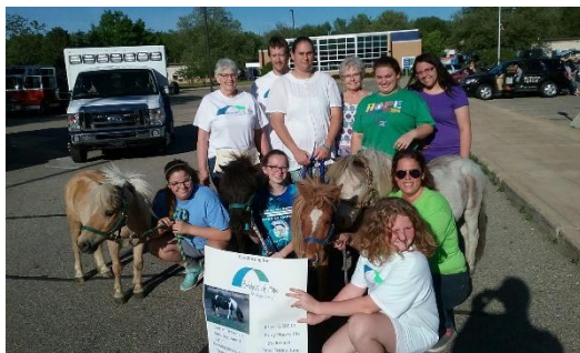
2017 Plainwell Days Festival Parade

Lastly, we would like to thank the individuals and organizations that have made in-kind donations this year, valued at over $8000. This includes supplies donated for office and program use, office space (graciously provided, rent-free, by Clearwater Financial), meals for program participants, and much more. Meals were provided by the Plainwell Meijer, Plainwell Arby's, Plainwell Wendy's, Plainwell Pizza Hut, McDonald's of Allegan and Plainwell, Allegan's First United Methodist Church, Allegan's Blessed Sacrament Church, and countless thoughtful individuals across the county. We were also fortunate enough to receive an anonymous donation designated for the purchase of a projector for use during workshops and meetings.